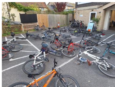
Car Park – Bike Park!

(Editor's note – the car park on a Tuesday afternoon often looks like a drop-in for bikes!)