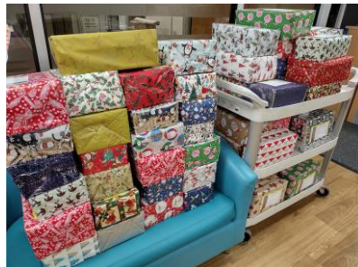
Christmas Shoe Boxes

'In October we again started packing shoeboxes full of goodies to send to Romania to brighten the Christmas of needy families. Some of our members had been knitting during the year too, so we were able to supplement the shoeboxes with a sack of handmade blankets, and extra scarves, gloves etc. Once