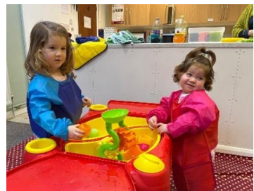
Having fun at Stay & Play!

Each week's session starts with time for freeplay for children to explore a range of toys at their own pace and includes a messy table activity, such as coloured rice, cornflour, kinetic sand, playdough or water play. Our 'tidy up' music has everyone helping to put the toys away ready for snack and story time. Each week we have a story, often a well known children's book that families may already be familiar with, to which we link a thought about how God loves us each of us. We finish our story time with a very short prayer of thanks.'