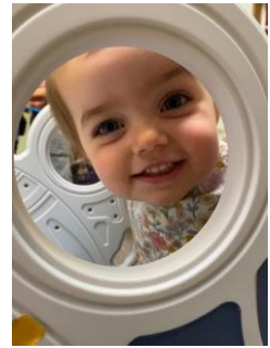
I can see you!