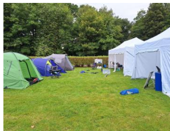
Camping at Stafford

In August six young people and 3 leaders set off for another Residential trip – this time returning to camp at Stafford showground for 5 nights in a grassy field. The camping was fun, and so were the fun and games including a pub quiz and a board games evening. But even better was being able to join in with thousands of other young people in worship and for teaching. One of the young people said, 'such a vibe – so perfect'