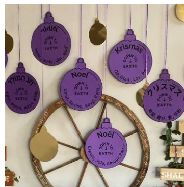
Hope, Love, Joy, Peace