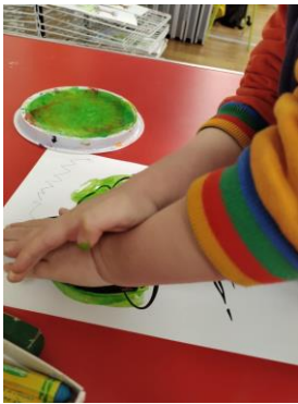
Having messy fun!