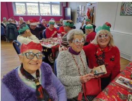
Christmas at Tuesday Treat

Our usual format is to serve hot drinks and tasty treats to our guests, creating a cosy atmosphere but we've also continued to celebrate special events and enjoyed short talks, charity sales, karaoke and a guest singer. At Christmas, over 60 of us