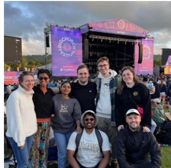
Big Church Festival