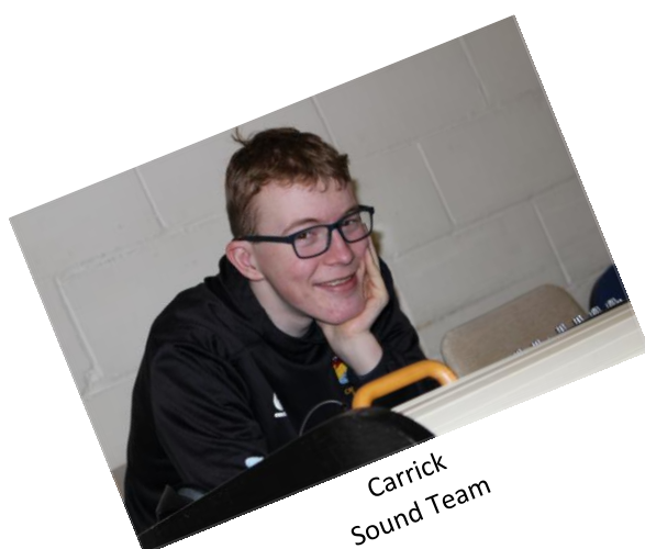
Carrick Sound Team