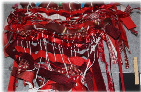
Red Weaving Trail to the Tree

'On Good Friday I woke up feeling very low and tearful which is something I haven't felt for a long time. I wasn't able to get to the early morning service but remembered that Trail to the Tree was on in the church later in the day. Arriving just after midday to a warm welcome and a cup of tea and a chat I started off my journey. First I started in the beautiful garden with scriptures and readings to think about Jesus being alone in the garden. After a while I felt myself sitting in the garden with him. While moving around the different areas and taking part in the activities so