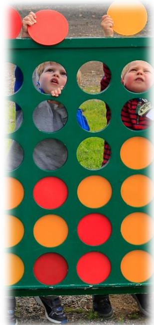
Children at the Mix

Wednesday mornings Littlefoot Club , our Carers, Parents and Toddlers club, continues to be a happy, thriving group serving the local community and the wider