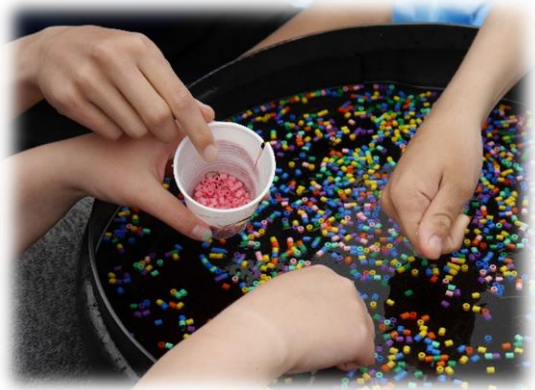
One of the exasperating Slum Survivor tasks!