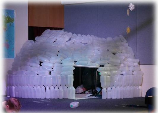
Polar Explorers' Igloo

The Girls Only Project to mentor our teenage girls and the Da Lads mentoring project for the boys continue.