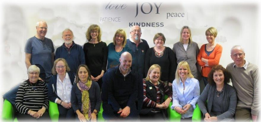
Prayer Team members

Prayer surrounds everything we do, but from time to time we set aside specific times for concentrated prayer. Of special note were the early morning prayer times in Holy Week and some prayer walking we did in the Autumn.